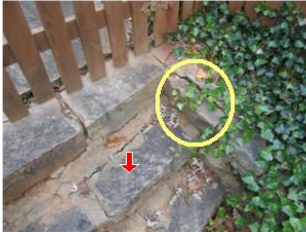
2.4 Picture 3

The slate floor on the patio at the front of home has deteriorated mortar or grout, and is loose and uneven in areas. A general replacement is likely. A qualified contractor should inspect and repair as needed.