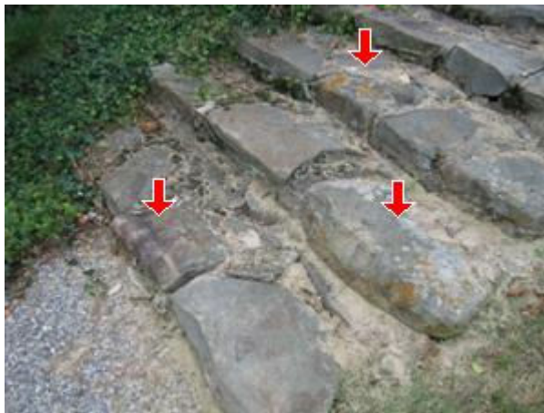
2.4 Picture 2

The rock steps at the front of home and rear of home are loose in areas. Water can cause further deterioration if not repaired and sealed properly. A qualified contractor should inspect and repair as needed.