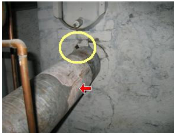
8.5 Picture 1

The vent pipe for oil fired boiler needs mastic sealed around pipe where it enters chimney. There is also a possibility of asbestos on the vent pipe. This is a safety issue and should be repaired. I recommend a qualified licensed heat contractor inspect further and repair as needed.