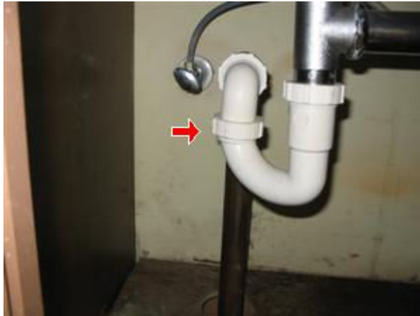
6.0 Picture 1

The waste line has a S-trap, and should be changed to a P-trap and "Auto-vent" at the Kitchen sink. This is not considered up to today's standard. A qualified licensed plumber should repair or correct as needed.