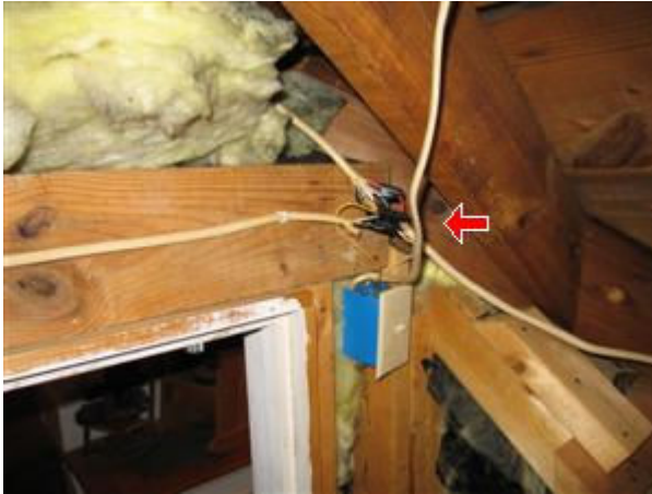
7.3 Picture 1