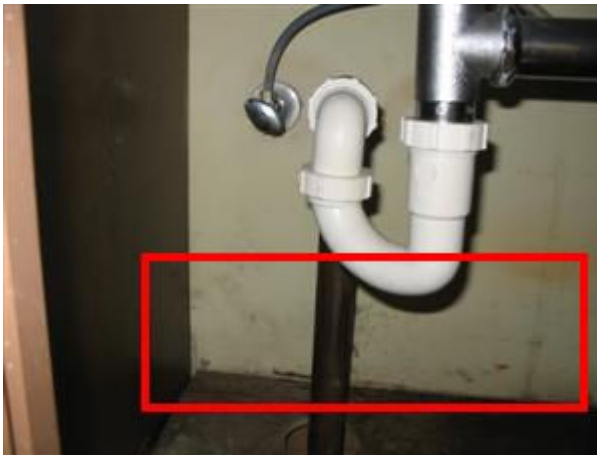
4.1 Picture 1

Signs of fungi growth is present on the interior wall of kitchen cabinetry in several areas. We did not inspect, test or determine if this growth is or is not a health hazard. The underlying cause is moisture. I recommend you contact a mold inspector or expert for investigation or correction if needed.