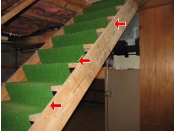
4.3 Picture 1