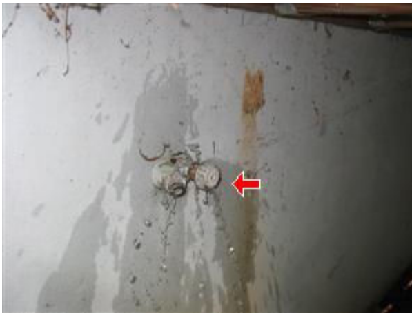
6.1 Picture 2

Polybutylene plastic plumbing supply lines (PB) are installed in the subject house. Polybutylene has been used in this area for many years, but has had a higher than normal failure rate, and is no longer being widely used. Copper and Brass fittings used in later years have apparently reduced the failure rate. This subject house has copper fittings. For further details contact the Consumer Plumbing Recovery center at 1-800-392-7591 or the web at http://www.pbpipe.com