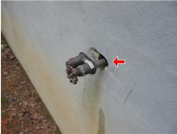
6.1 Picture 1