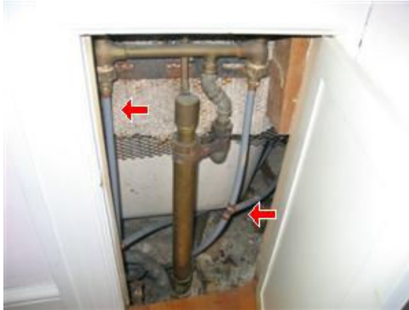
6.1 Picture 4

The water supply line for toilet is leaking at the guest bath. Repairs are needed. A qualified licensed plumber should repair or correct as needed.