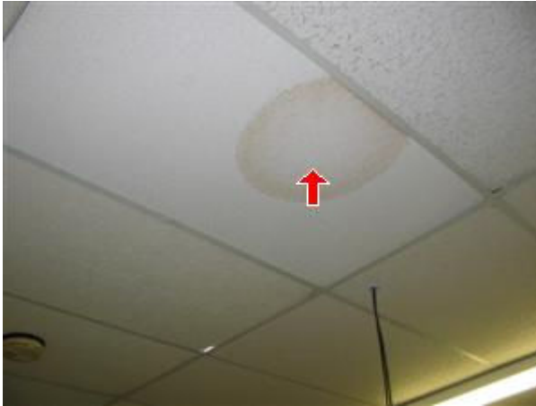
4.0 Picture 1