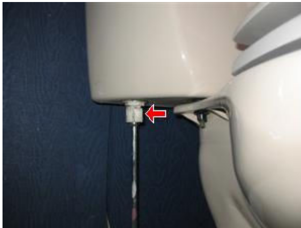
6.1 Picture 5

The water supply line for toilet is leaking at the guest bath. Repairs are needed. A qualified licensed plumber should repair or correct as needed.