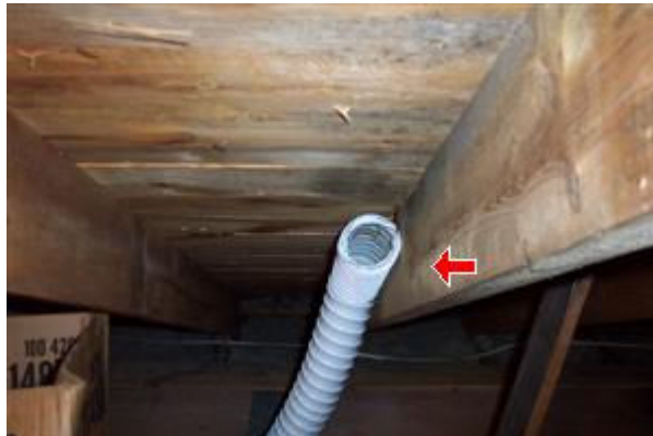
9.4 Picture 1

9.4 VENTING SYSTEMS (Kitchens, baths and laundry) Exhaust Fans: Fan Dryer Power Source: 220 Electric Dryer Vent: PVC Rigid Comments: The Exhaust fan does not vent to outside at the guest bath. Vent pipes should terminate outside and not in the attic. Many homes have their vent pipe poised at the roof vent such as yours. It is up to you to determine whether or not this is a concern or needs further consideration from a general contractor. A qualified contractor should inspect and repair as needed.