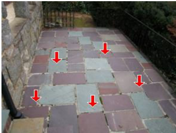
2.4 Picture 4

The slate floor on the patio at the front of home has deteriorated mortar or grout, and is loose and uneven in areas. A general replacement is likely. A qualified contractor should inspect and repair as needed.