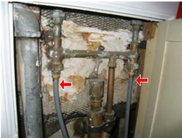
6.1 Picture 3

Polybutylene plastic plumbing supply lines (PB) are installed in the subject house. Polybutylene has been used in this area for many years, but has had a higher than normal failure rate, and is no longer being widely used. Copper and Brass fittings used in later years have apparently reduced the failure rate. This subject house has copper fittings. For further details contact the Consumer Plumbing Recovery center at 1-800-392-7591 or the web at http://www.pbpipe.com