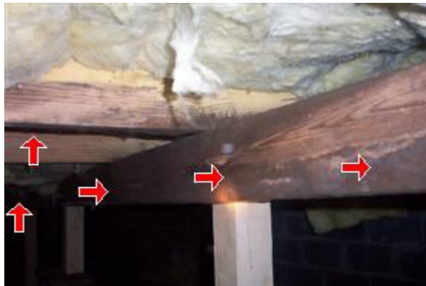
5.3 Picture 1

Signs of fungi growth is present on the floor system in crawlspace in several areas. We did not inspect, test or determine if this growth is or is not a health hazard. The underlying cause is moisture. I recommend you contact a mold inspector or expert for investigation or correction if needed.