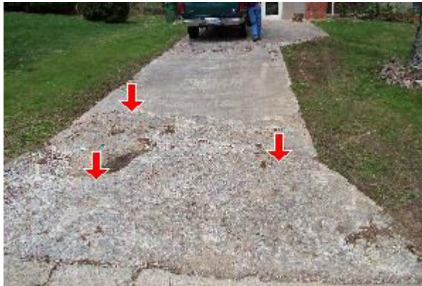
2.4 Picture 1

The concrete drive at the front of home are deteriorated in areas. A general replacement is likely. A qualified contractor should inspect and repair as needed.