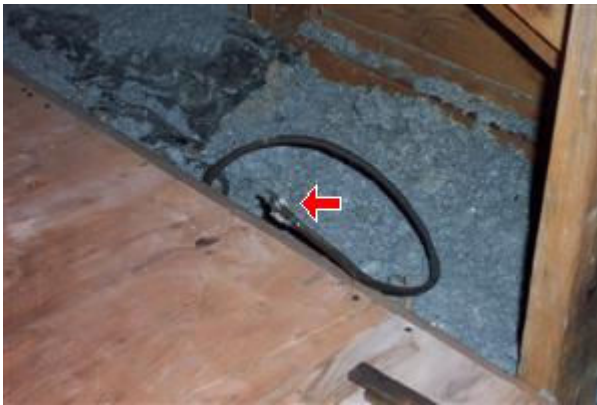
7.3 Picture 2