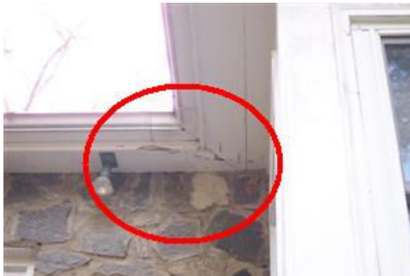
2.5 Picture 1

The soffit panel at eave on the front of home are weathered and beginning to deteriorate and peeling paint. Further deterioration may occur if not repaired. A qualified contractor should inspect and repair as needed.