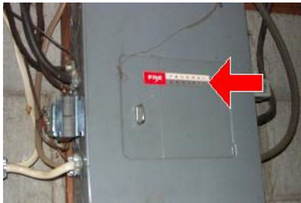
7.2 Picture 1

7.2 BRANCH CIRCUIT CONDUCTORS, OVERCURRENT DEVICES AND COMPATIBILITY OF THEIR AMPERAGE AND VOLTAGE Branch wire 15 and 20 AMP: Copper Wiring Methods: Romex, Knob and Tube, Not Visible Comments: You have a Federal Pacific panel which is legal, but there is a possibility that the circuit breakers may not trip when shorted possibly causing an electrical hazard. Opinions by licensed electricians on this panel varies between safe and unsafe. I recommend you consult a licensed electrician for an opinion and correct if necessary.