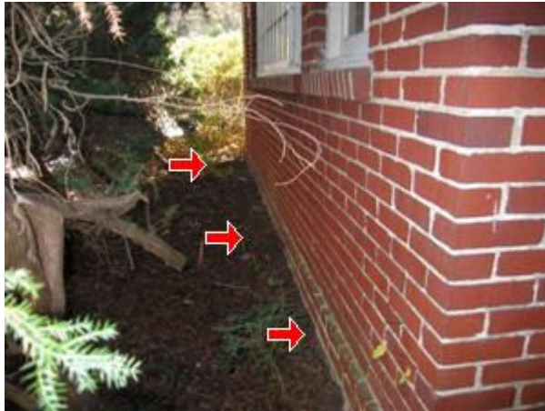
2.0 Picture 1

The Brick siding at the left side (facing front) is loose, and missing mortar. Further deterioration can occur if not corrected. A qualified contractor should inspect and repair as needed.